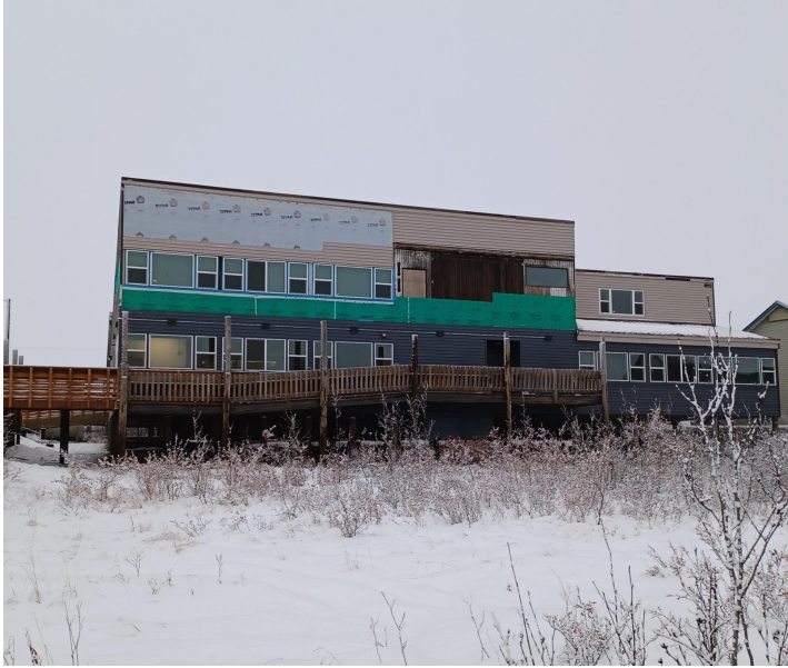
Photo: Renovations are ongoing at the Bethel Winter House facility, located at the “old senior center” at 127 Atsaq Road.

As COVID-19 impacted all of our community members across the region, concerns for our most vulnerable neighbors- those who are unhoused- were expressed by many. Historically, Bethel Winter House (BWH), our local nonprofit organization serving unhoused adults, has operated only seasonally and out of donated or rented spaces, most recently the Bethel Evangelical Covenant Church. With the threat of the virus and a need for more space, BCSF and a team of committee members- BWH board, TWC’s Executive Director, and a project manager- began the process of identifying possible locations and funding sources for a permanent shelter. With thanks to the City of Bethel, which donated the former senior center to BWH, the efforts of the committee and a number of funders, BWH occupied its first-ever permanent facility in December 2020. BWH’s goal is to be open year-round, at first overnight, and slowly offer more daytime services as funding, staffing and capacity increases.