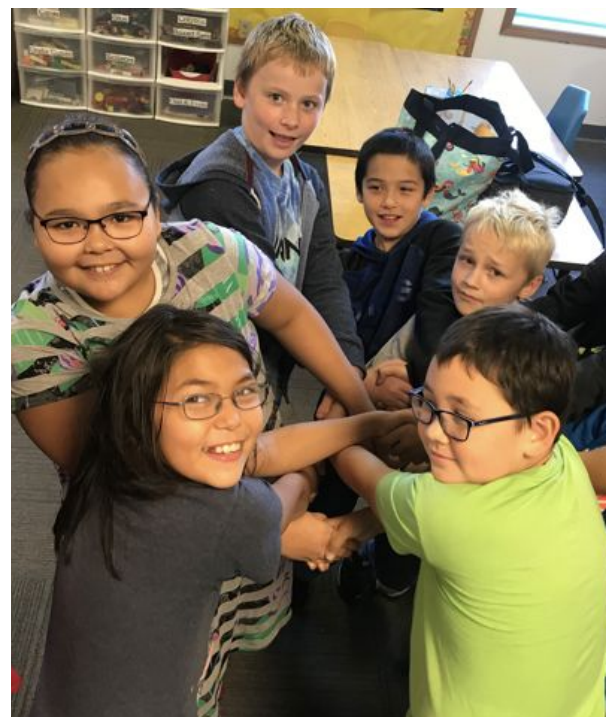
Photo: Students engage in team-building games (credit: Kuspuk School District).

www.bcsfoundation.org/arctic-health-fund .